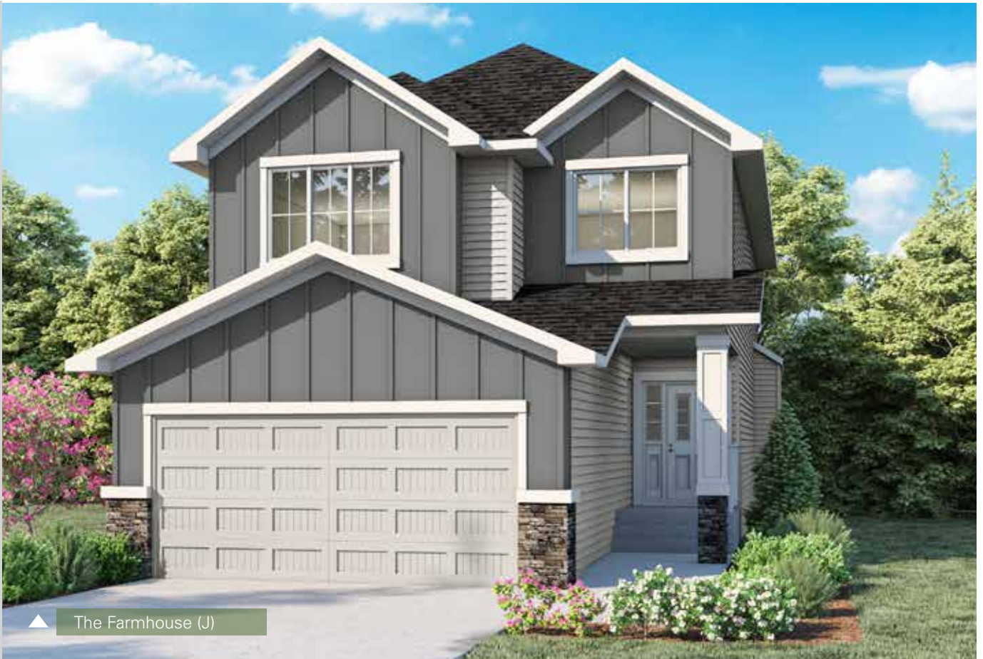
▲ The Farmhouse (J)