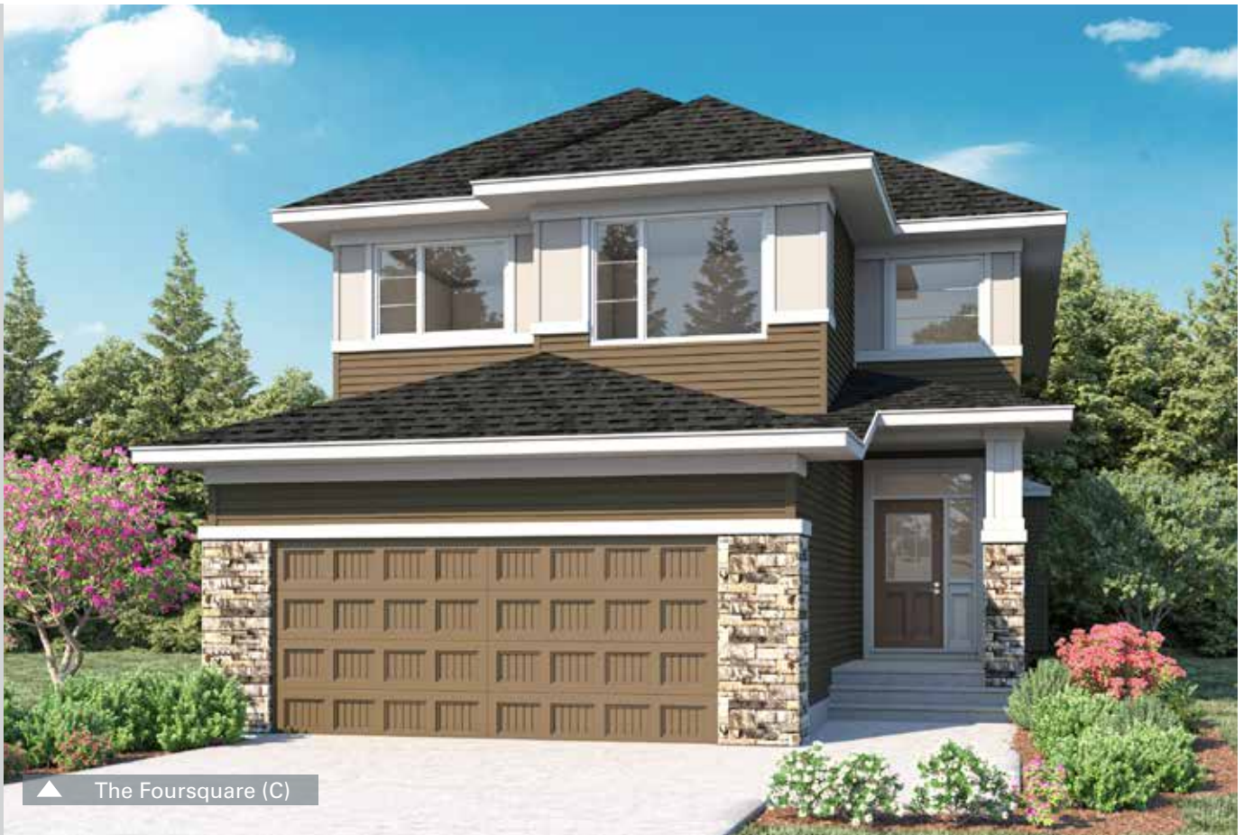
▲ The Foursquare (C)

MODEL 25 - 22 www.nuvistahomes.com Total: 2232 sq. ft.